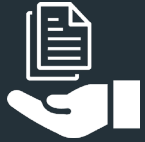
EXPANDING TREATY NETWORK